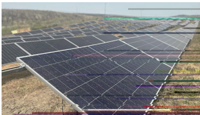
Figure 1: Project Picture